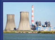
Coal based Power Generation 1000 MW