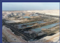
Lignite Mining 32.10 MTPA

We have a comprehensive strategic plan to become a 17000+MW Power company and 84+MTPA Mining Company.