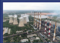
Lignite based Power Generation 3640 MW