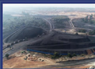
Coal Mining 20.00 MTPA