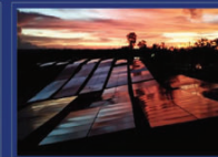
Renewable Energy (Solar) 1370 MW