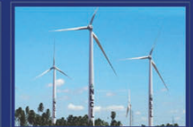
Renewable Energy (Wind) 51 MW

MTPA: Million Tonne per Annum / MW: Mega Watt